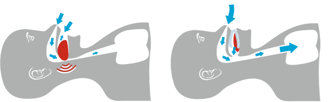
When the jaw is relaxed, the tongue often falls back into the throat area and causes the airway passage to restrict or even close off.

The natural airway passages are restricted in sleep when the soft palate and tongue relax. This causes a vibration in the soft tissues of the throat when breathing, generating the familiar snoring noise.